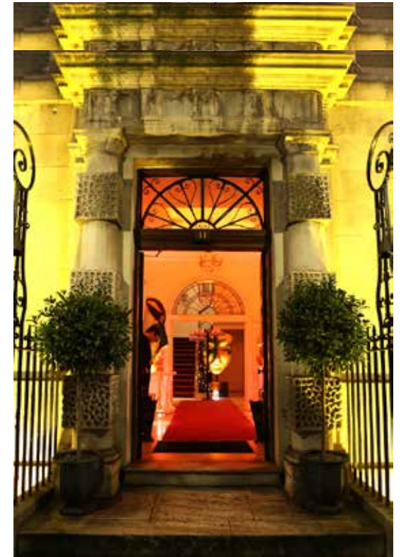
Christmas at No.11 Cavendish Square

Welcome to our Grade II-listed Georgian townhouse, with exceptional classic and modern spaces, fine dining prepared freshly on site, and fantastic theming – perfect for your end-of-year celebration. Christmas is all about letting your hair down and having fun, and what better way to end the year than spending it in an elegant Masquerade Ball with a touch of mystery. We are transforming our spaces with lavish theming, opulent décor and glistening lights – all of which will lead to an unforgettable experience. The attention to detail throughout promises to transport guests to the grandeur of a masquerade ball at a 15th-century manor house. Whether you are looking to host a 300-person drinks reception, a 240-person sit-down dinner or a smaller intimate soirée, our spaces are versatile and unique. Our aim is to make your event a memorable experience for guests from start to finish, so that everyone will be talking about it until Christmas 2025! We look forward to welcoming you to No.11 Cavendish Square and delivering the perfect event.